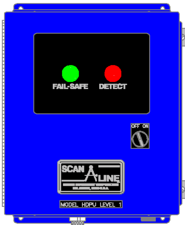
Model HDPU Level 1