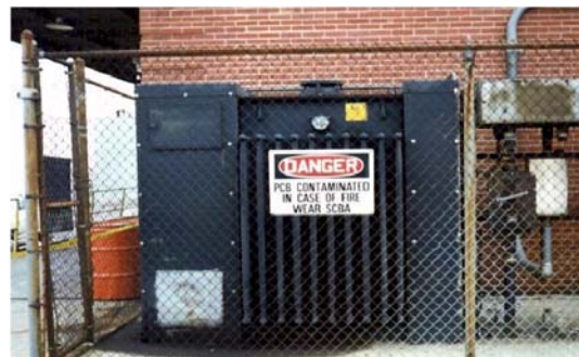
Maintaining / Upgrading Transformers