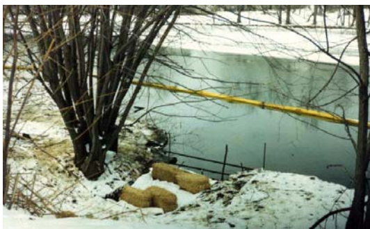
Containing and Abating Spills