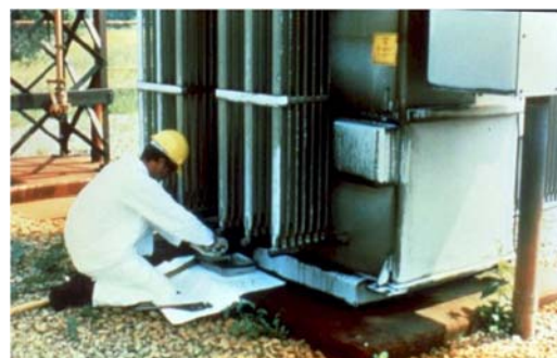
Sampling Transformer Oil